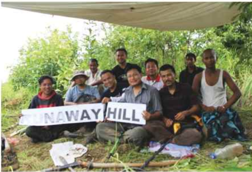
Members of ICF after indemnification and excavation of Runaway hill

Harva Khangai where the first battle on Indian soil was fought. Second one is the identification of the crash site of General Orde Wingate's plane near Thiulon in Tamenglong district.