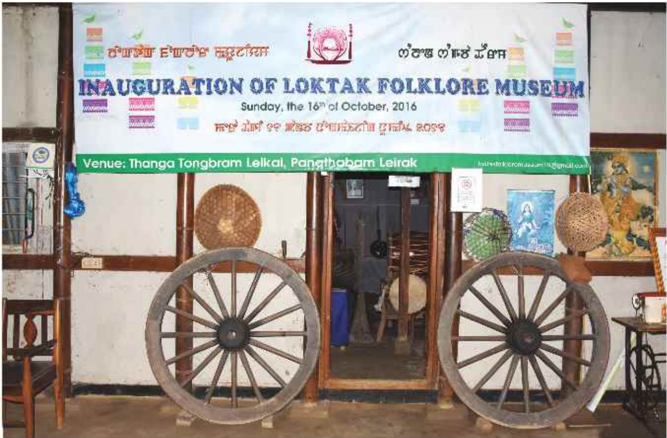
Tongbram Amarjit Founder, Loktak Folklore Museum

A museum dedicated to the fishing community of Loktak Lake