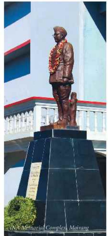
J.N.V Memorial Complex, Moirang

Established as an art studio under the title of The RKCS, Chitralaya in 1947, RKCS Art Gallery was officially inaugurated as a full-fledged gallery on 5th May 2005. The gallery displays a number of historical paintings of the