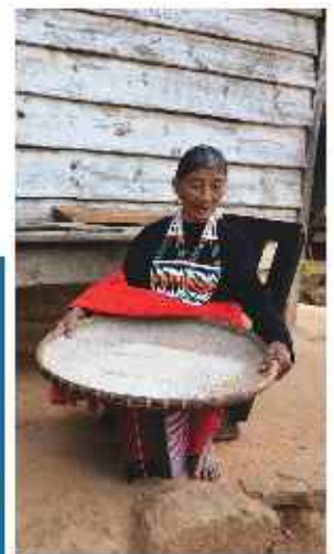
The district is inhabited by the Tangkhul Tribe- the colorful warrior tribe, the Kukiis and the Angamis. The Tangkhul tribe are considered one of the oldest major tribes of Manipur.

as a potential tourist destination in Manipur. The festival was celebrated by the locals at the District level till 2016 when the State Government in 2017 declared that the Shirui Lily Festival would be celebrated at the state level. After the successful run of two previous editions, Shirui Festival 2019 was held on 16-19 October 2019. Ukhrul District Headquarter, Bakshi Ground, Tangkhul Tribe Long (TNL) Ground are the main event venues of