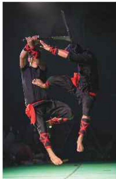
Thang-ta: Manipuri Martial Art

Tourism brings people together, helps understand each other, offers mutual understanding and helps us grow as people. Through this industry, we learn and share experiences about diverse cultures and it teaches us how much we need each other to help this industry grow. In the spirit of 'Unity in Diversity,' let's all unite and celebrate this year's edition of the festival and I wish all an enjoyable celebration of Manipur Sangai Festival 2019.