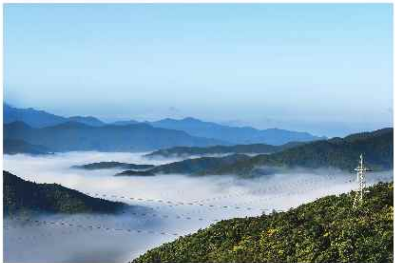
A view of Tengnoupal

Perched on top of a hilltop, with its landscaped garden, in-house restaurant, and two beautiful cottages, Gaby's Café is a perfect weekend gateway.